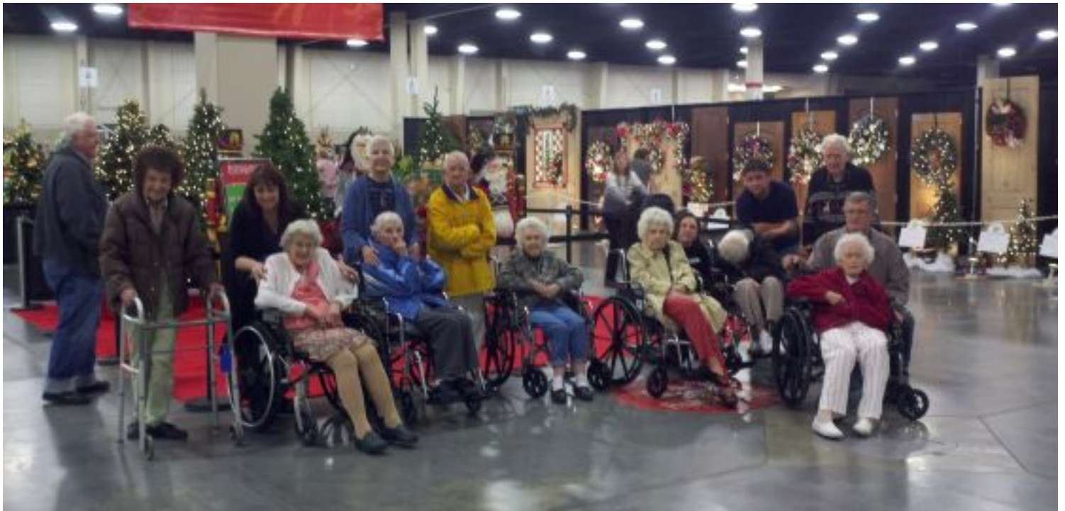
FESTIVAL OF TREES 2011