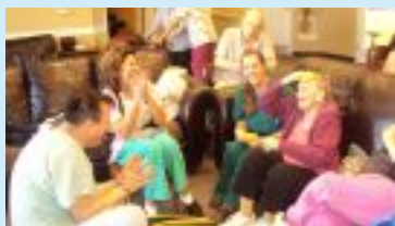
Mauvia Playing Ball Toss